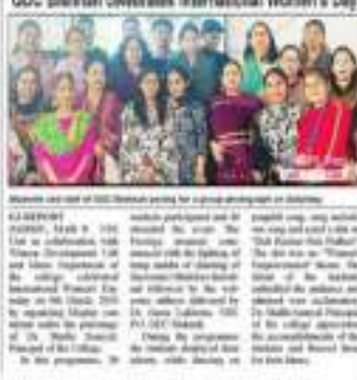
Members of NSS wing of GDC Bishnah posing for a group photograph on the occasion.